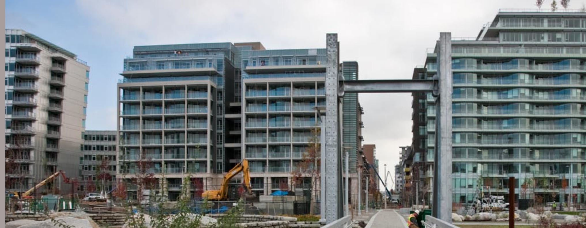
With building heights in the Millennium Water development ranging up to 13 storeys tall, potable water sitting in the domestic plumbing will create positive pressure in basement water pre-heating tanks. This helps reduce the risk that potable water could ever be contaminated by heat-recovery fluid (which only circulates as high as two storeys), allowing the use of more efficient, single-walled heat exchangers.

“This is the way all projects should go,” says Myers. “This system will last the life of the building.”