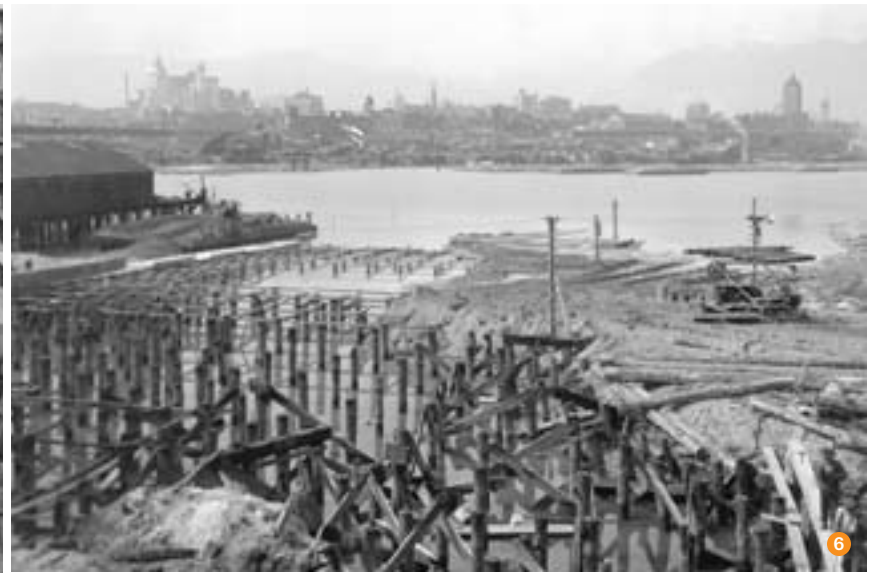
1 Vancouver from the Lee block at the corner of Broadway and Main Street, 1913 2 Behind L.A. Hamilton's campsite on the south side of False Creek, 1886 3 Looking east from the shore at the foot of Nicola Street, 1900 4 One of the last squatters' shacks near the Burrard Bridge on False Creek, 1934 5 Hull No. 106 under construction at West Coast Shipbuilders Limited, 1942 6 West Coast Shipbuilders Limited site under construction, 1941